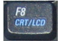
Examples of video toggle keys