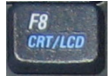
Examples of video toggle keys