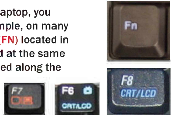
Examples of video toggle keys

For PC Laptops: Depending on your model of laptop, you may need to toggle the display mode. For example, on many laptops, you must hold down the function key (FN) located in the lower left-hand corner of the keyboard, and at the same time, press the video toggle key , which is located along the top of the keyboard. Look for the text CRT/LCD or an icon of a display and a laptop .