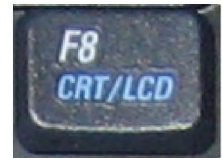
Examples of video toggle keys